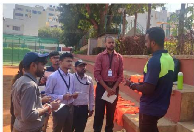
With Tenvic, Bangalore