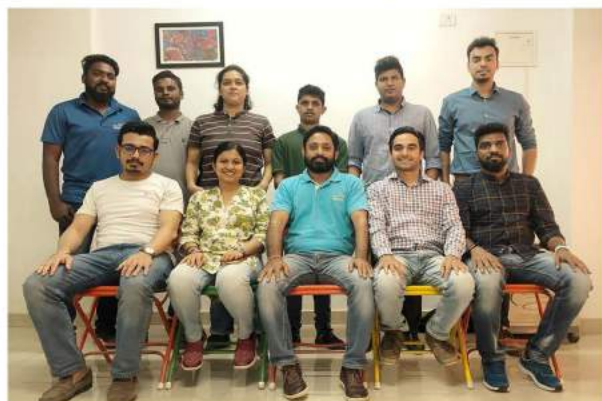
With Sportify, Bangalore