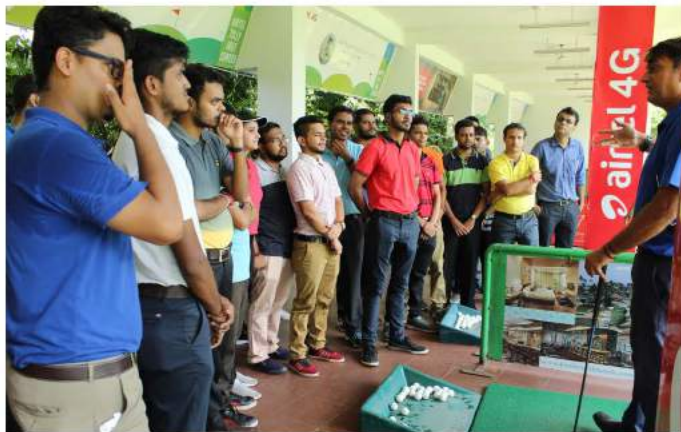
At the Golf Academy