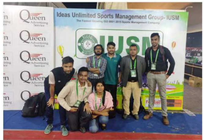
At Fit Expo 2