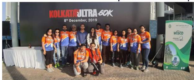
Some of our students at the Ultra Marathon Race