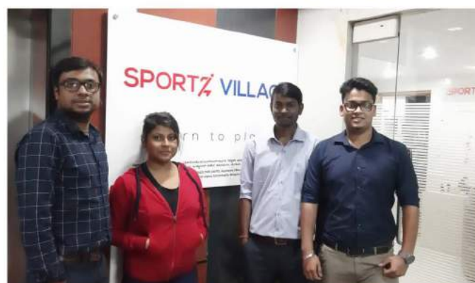
With Sportz Village Bangalore