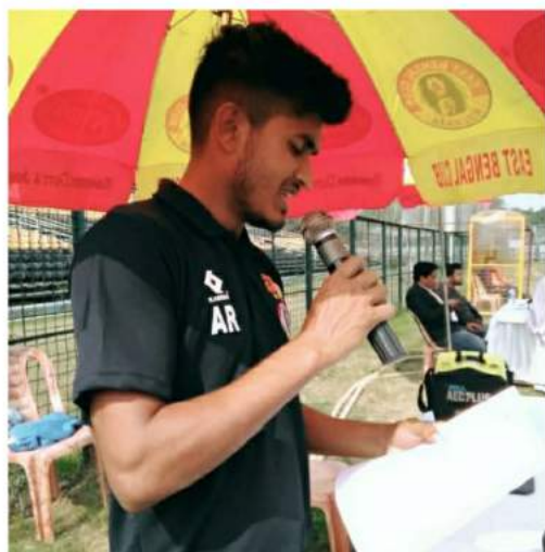
With Quess East Bengal, Kolkata