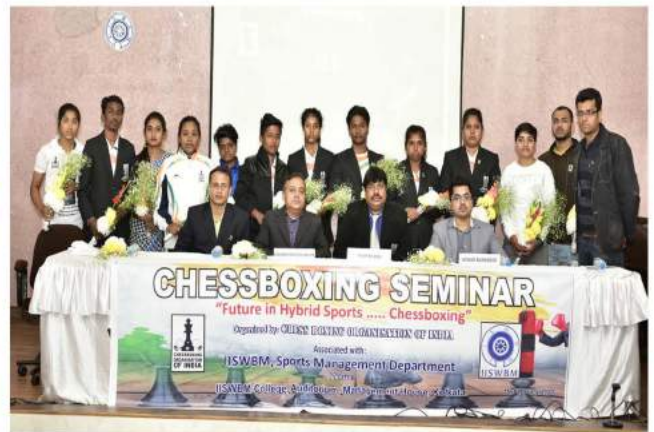
Department organised a seminar on the promotion and development of Chessboxing