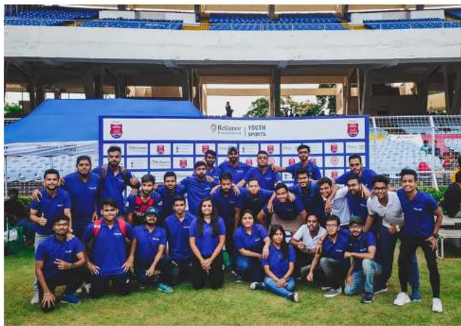
In an event of Reliance Foundation Youth Sports