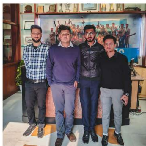
With the All India Football Federation (AIFF), Delhi