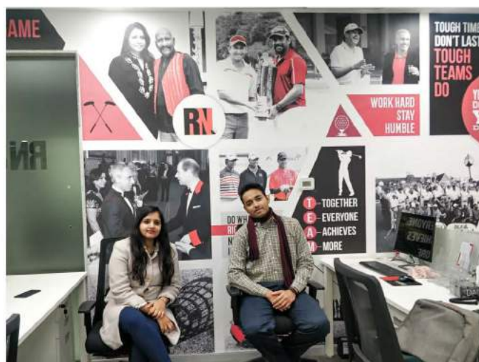
With RN Sports Marketing, Gurugram