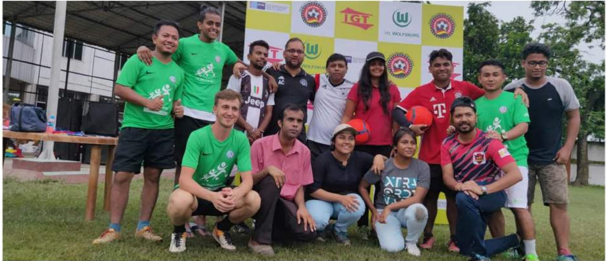
In an event of the German Football Academy