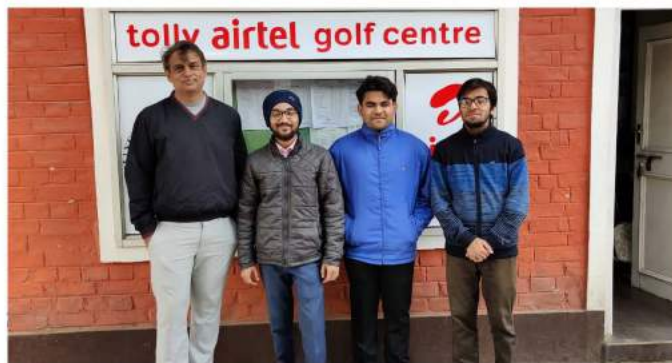
With Protouch Golf Academy, Kolkata