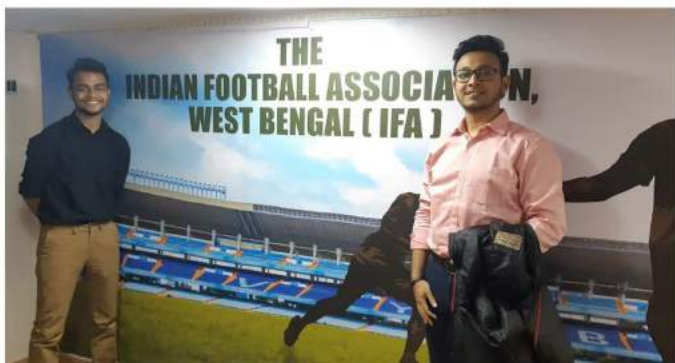
With Indian Football Association, Kolkata