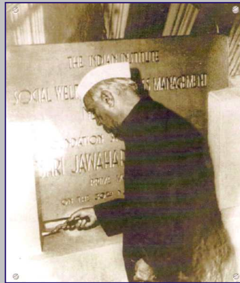
Pandit Jawaharlal Nehru laying the Foundation Stone of the Academic Block-1958