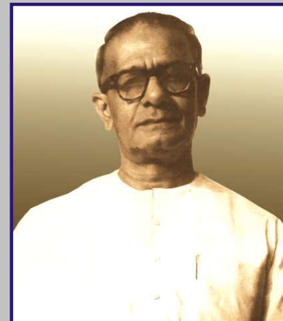
Prafulla Chandra Sen, Chief Minister of West Bengal (1962-1967) & President Board of Governors (1963-1990)