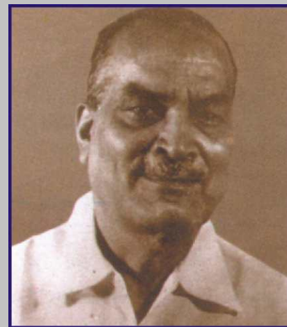
Dr. B. C. Roy, Chief Minister of West Bengal (1948-1962) & the Founder President Board of Governors